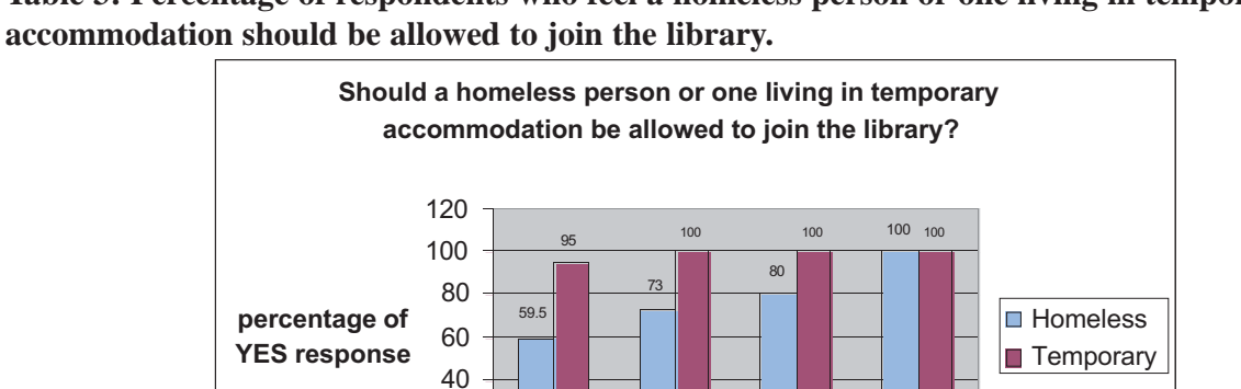
Table 3: Percentage of respondents who feel a homeless person or one living in temporary

As envisaged, managers and specialists appeared to have a more open view and were more amenable to allowing homeless people to register than front-line staff. However, table 3 illustrates that all staff more readily accept those in temporary accommodation.